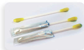
Path-Chek® Hygiene Protein