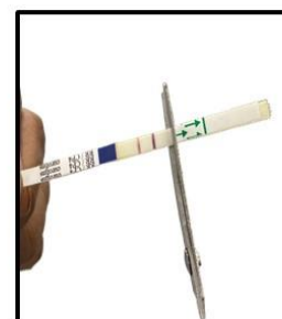
Cutting Of Strip For Permanent Record Storage and Read In RapidScan System