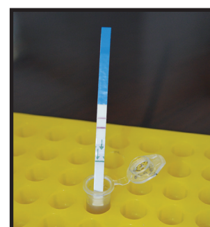
LFS Strip in Sample