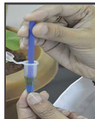
Extracting protein by crushing with pestle